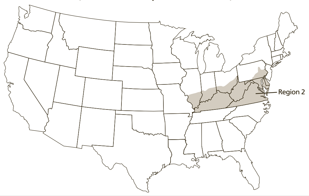
REGION 2 (Maximum Rate 5.3 pt/A, Alternate Years)