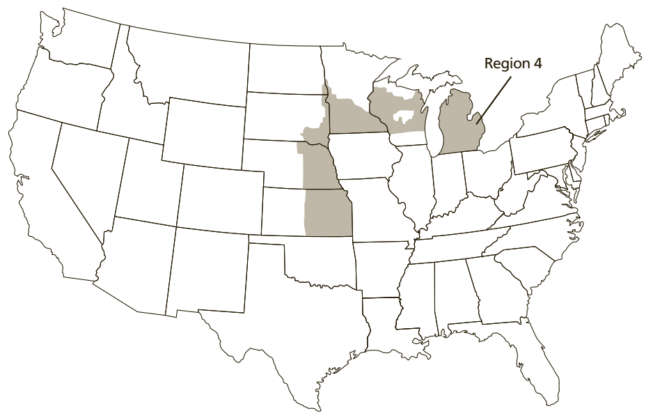
REGION 4 (Maximum Rate 3.5 pt/A, Alternate Years)