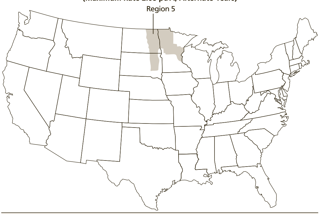
REGION 5 (Maximum Rate 2.68 pt/A, Alternate Years)