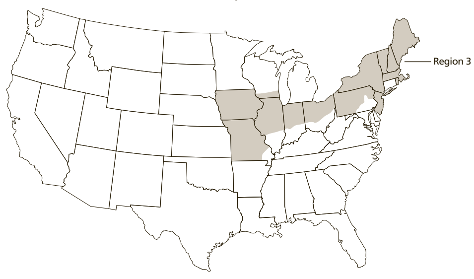
REGION 3 (Maximum Rate 4.5 pt/A, Alternate Years)