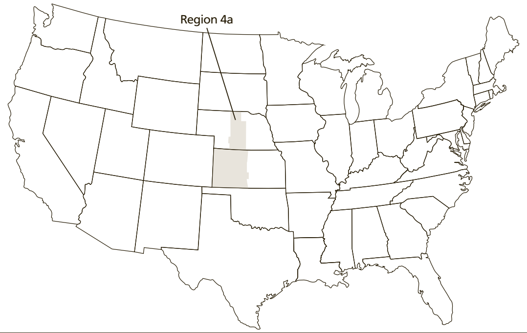
REGION 4a (Maximum Rate 3.5 pt/A, Alternate Years*)